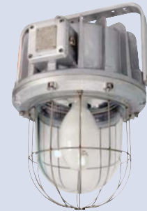
The 261 with wire guard

The 261 is an efficient high wattage wellglass for general task area and highbay lighting. The luminaire has a side mounted increased safety terminal chamber eliminating the need for flameproof glands.