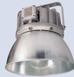
The 261 with external reflector