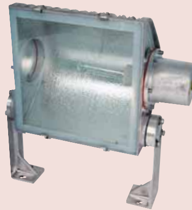
1000W and 2000W versions

The 503 is a high powered floodlight with a wide ambient temperature range. The high upper ambient and corrosion resistant aluminium construction, make the 503 ideal for use even in the hottest and hostile environments.