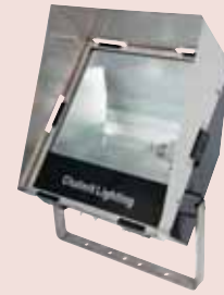
The 854 with anti-glare shield

The 800 series is a range of stainless steel asymmetrical floodlights. These floods are designed for optimum light output and efficiency to ensure the minimum number of luminaires is required.