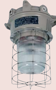
The Eclipse Junior with wire guard

The Eclipse Junior is a compact wellglass that incorporates the low maintenance features of the Eclipse II.