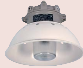
The Eclipse Junior with external reflector